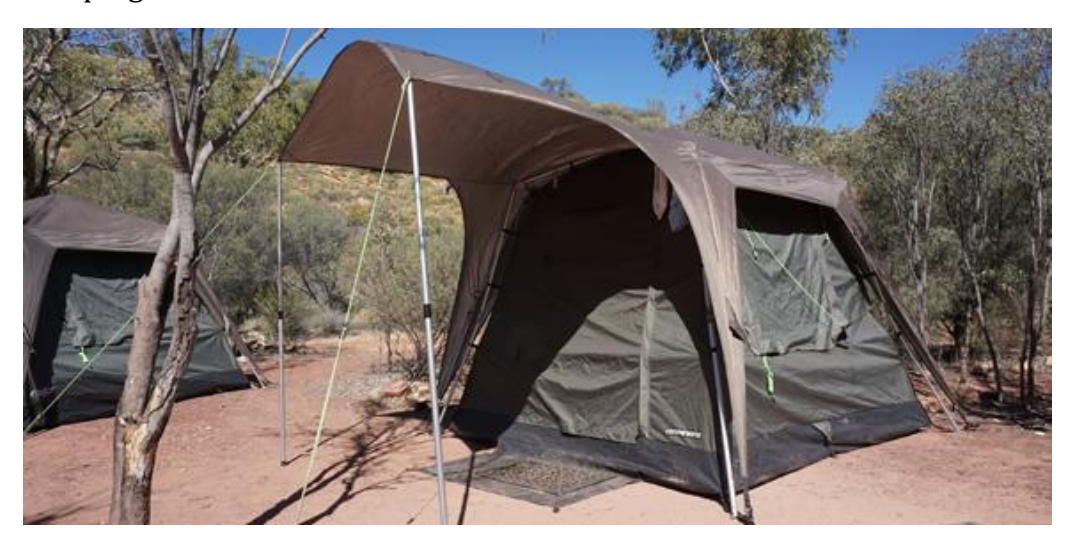
Camping Adventure 2 nights

Location is everything – and we are very lucky to be able to take advantage of a campsite at beautiful Ormiston Gorge. Ormiston Gorge is a 2 hour drive from Alice Springs With a short 5 minute walk to the swimming hole this is not only a beautiful location but central to most of our walks, minimising our transfer times each day – with our guests walking directly into camp on day 1. For the first two nights you will enjoy all the fun of a camping adventure, but with the little extras. You'll arrive at camp to find your walk-in touring tent set up for your arrival including an off the ground bed with a deluxe camping mattress and pillow. There are toilet and shower facilities provided in the campground.