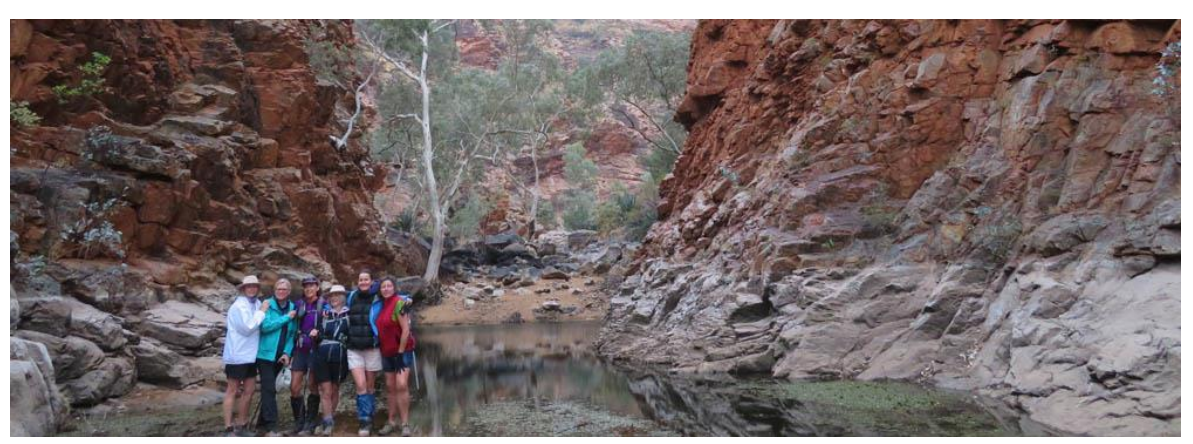
Ochre Pits to Serpentine Chalet Gorge