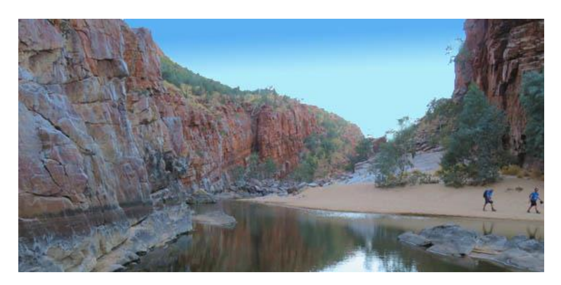
Glen Helen Homestead 2 nights

Location is everything – and we are very lucky to be able to take advantage of a campsite at beautiful Ormiston Gorge. Ormiston Gorge is a 2 hour drive from Alice Springs With a short 5 minute walk to the swimming hole this is not only a beautiful location but central to most of our walks, minimising our transfer times each day – with our guests walking directly into camp on day 1. For the first two nights you will enjoy all the fun of a camping adventure, but with the little extras. You'll arrive at camp to find your walk-in touring tent set up for your arrival including an off the ground bed with a deluxe camping mattress and pillow. There are toilet and shower facilities provided in the campground.