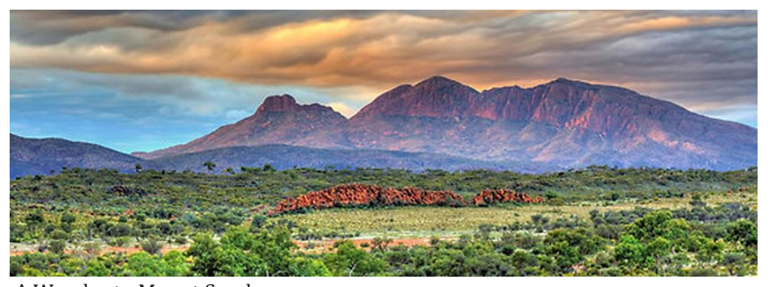
A Wander to Mount Sonder