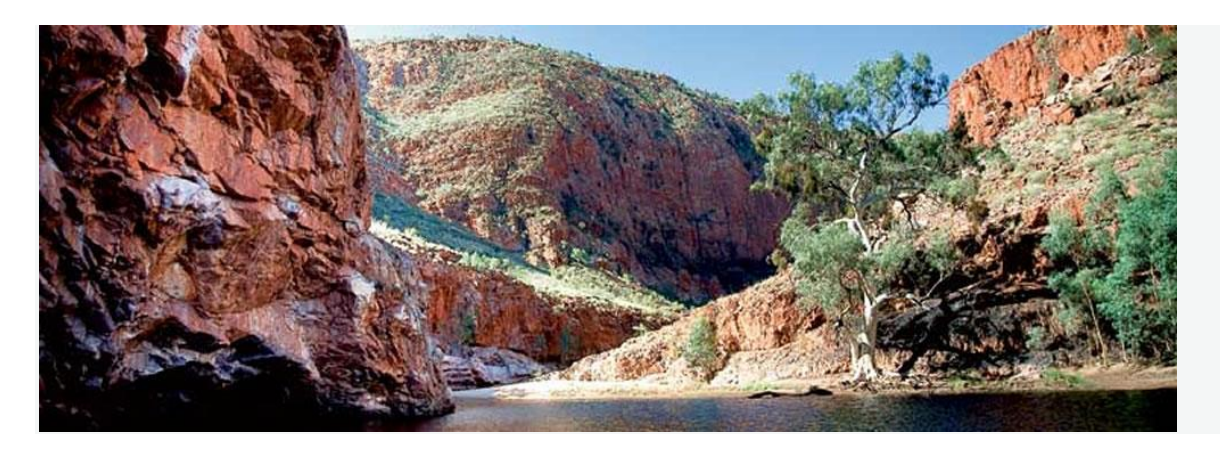
Welcome to Country - Stanley Chasm - Ormiston Gorge & Pound

Day 1 - Arrive Alice Springs transfer own arrangements to the Mecure Hotel (B)