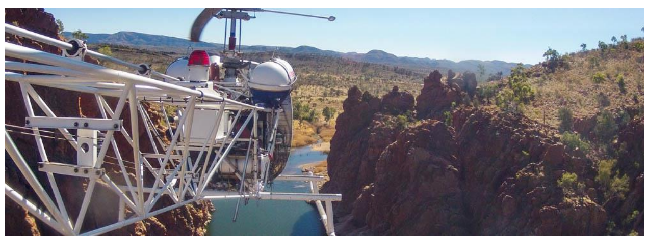
Ormiston Gorge to Glen Helen Homestead - Plus Helicopter flight