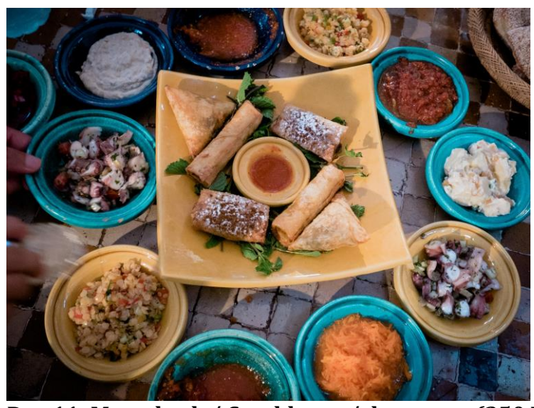
Day 11: Marrakech / Casablanca / departure (250 KM)