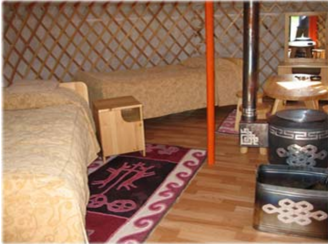
inside Ger Camp