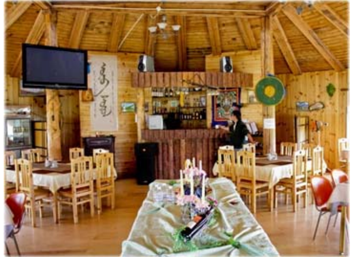
Ger Camp Restaurant