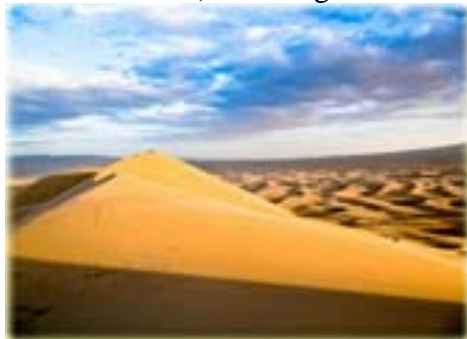
Mongolian sand dune

After breakfast, take a trip to Khongor sand dunes. These are Mongolia's largest sand dunes, reaching a height of 300 meters in some areas. The sand dunes change color with each hour of the day, from yellow to silver to rose-color at (sunrise or sunset). Overnight in tourist camp. (B+L+D)